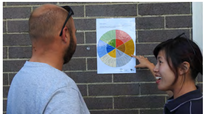
Assessing the odour