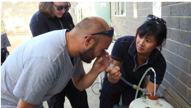
Sampling the odour

The odour booth was again a hit as EPA Victoria asked participants to smell different odours and then asked them how to describe them. The booth was highly interactive and allowed residents to learn how to improve their reporting skills when odour incidents occur in the region.