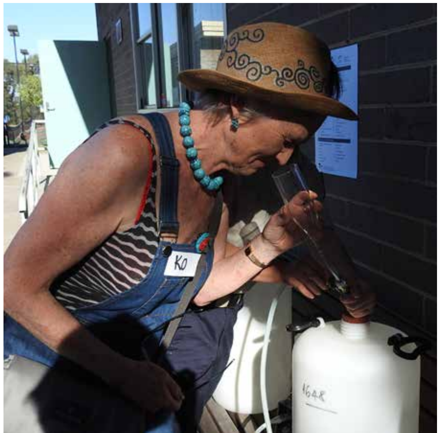
Testing for odour at the EPA odour booth