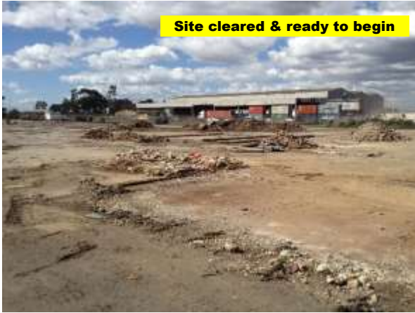
Site cleared & ready to begin