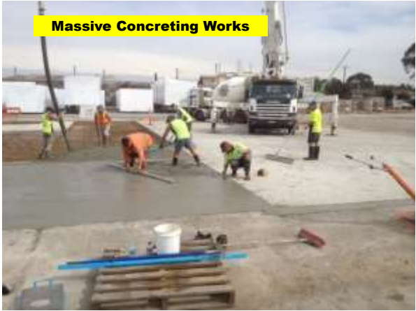
Massive Concreting Works