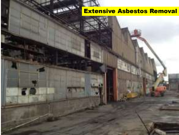
Extensive Asbestos Removal