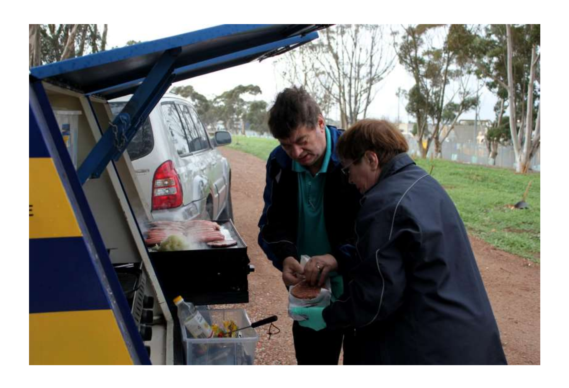
Altona Lions preparing the BBQ for the planters