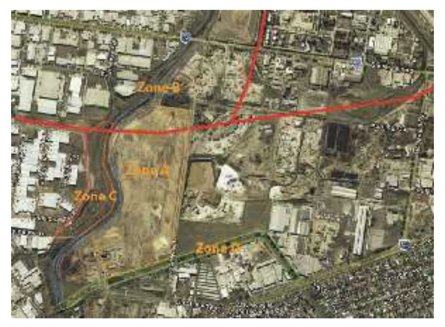
Brooklyn Industrial Precinct