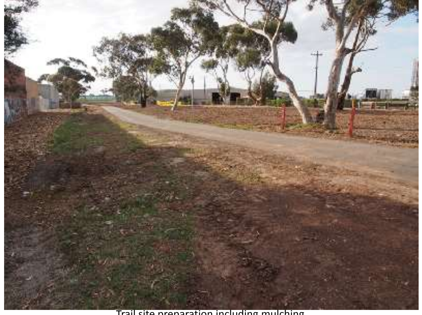
Trail site preparation including mulching