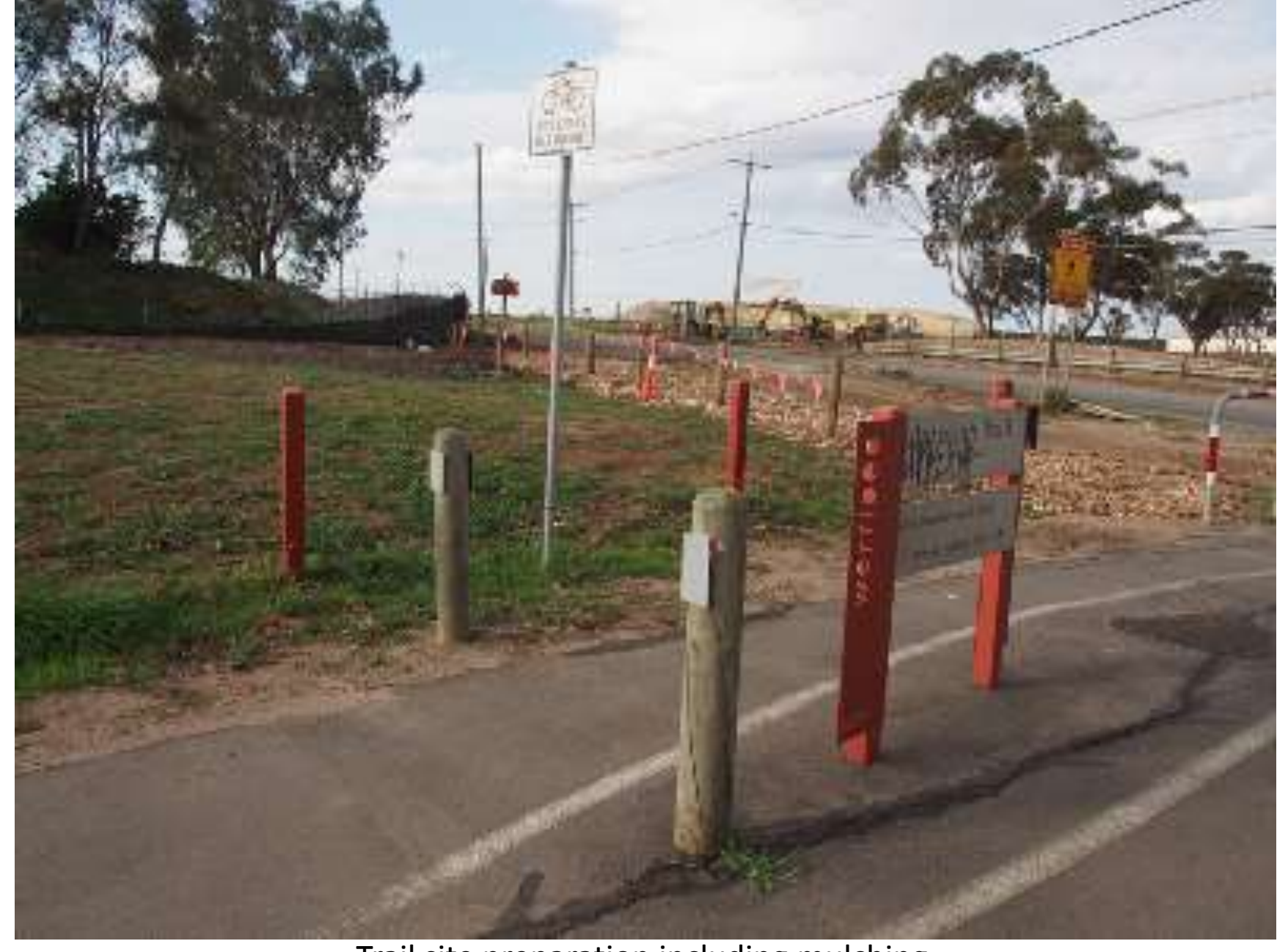
Trail site preparation including mulching