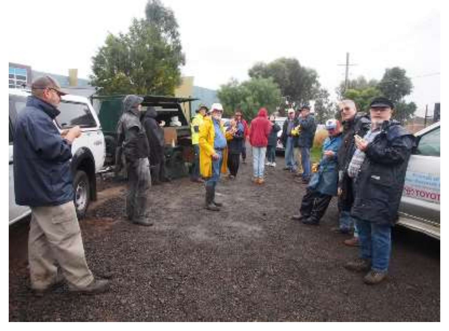
A well deserved BBQ for the planting volunteers.