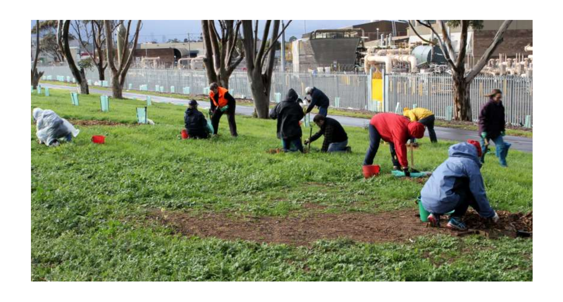
Some of 60+ attendees at the planting on a very inhospitable day