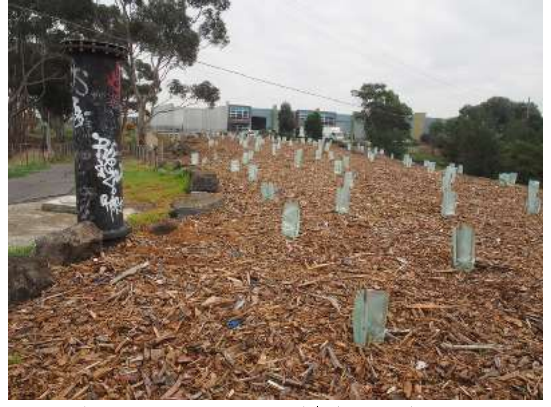
Planting commences at Kororoit Creek / Federation Trail intersection.