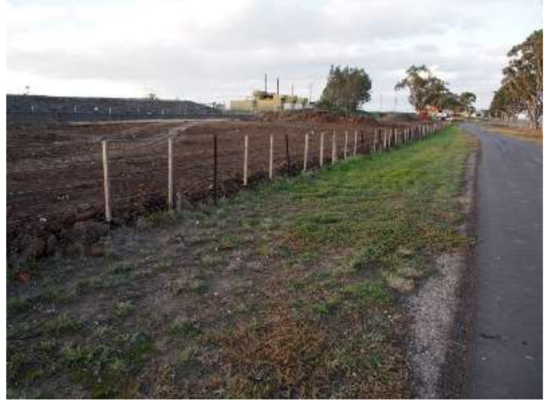
Trail site preparation including massive earth works