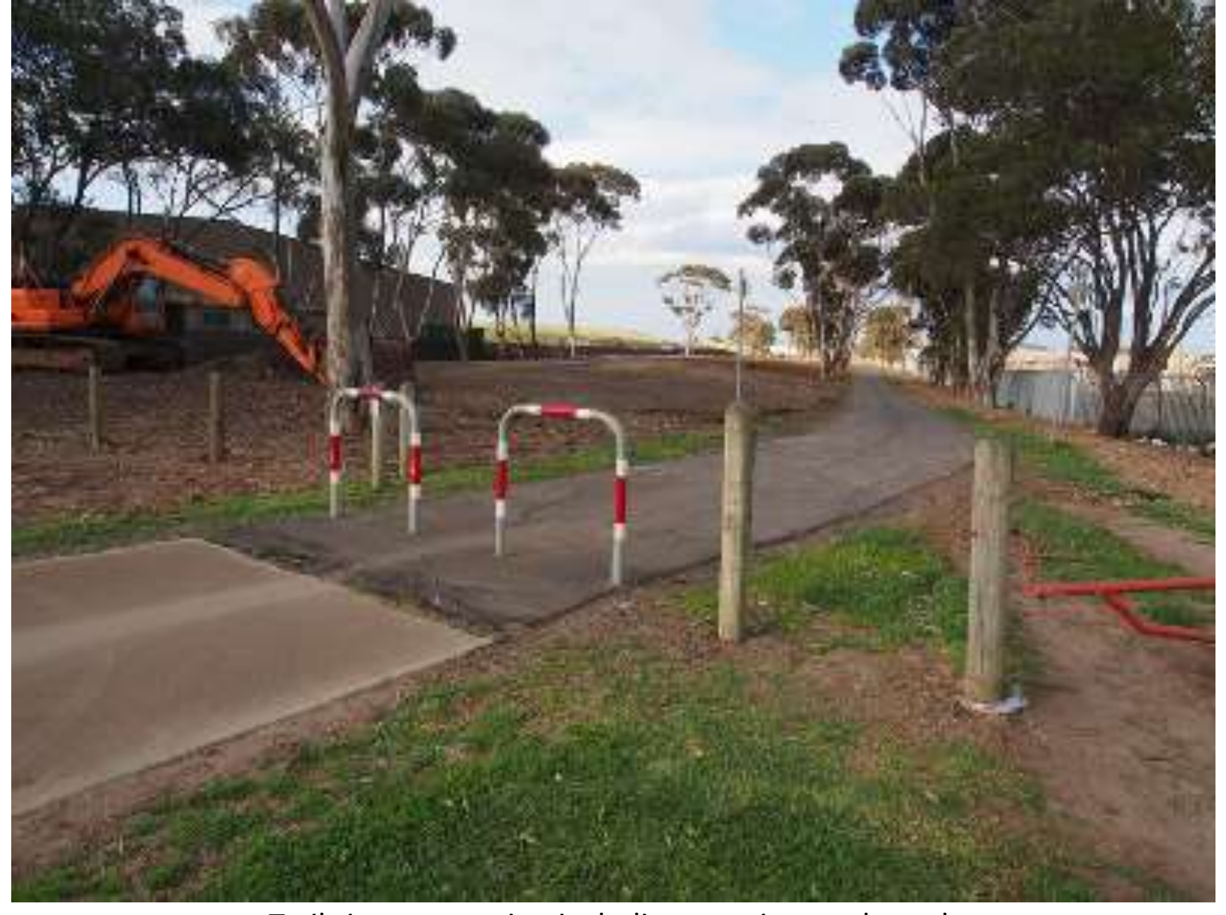
Trail site preparation including massive earth works