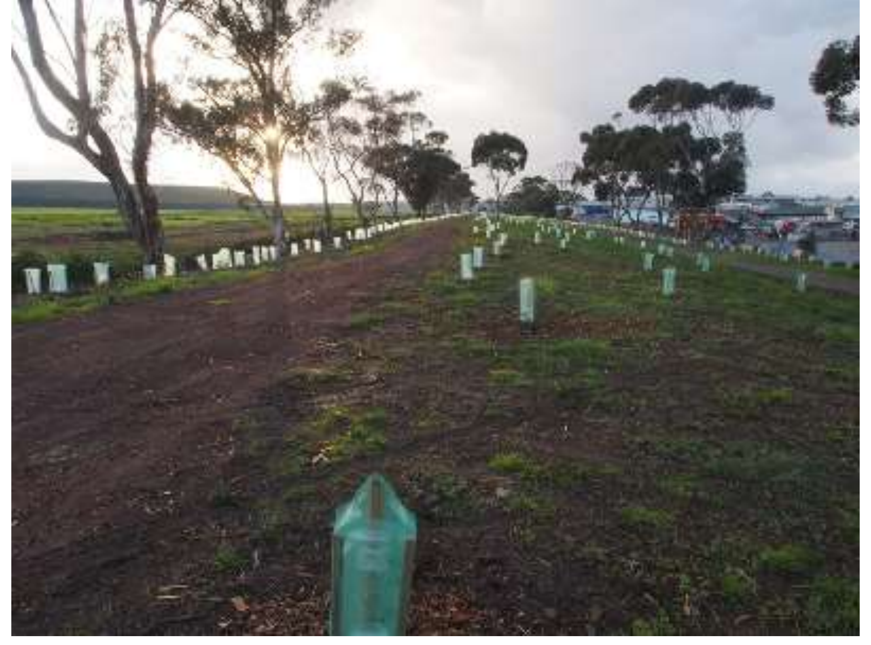
Planting commences along Federation Trail.