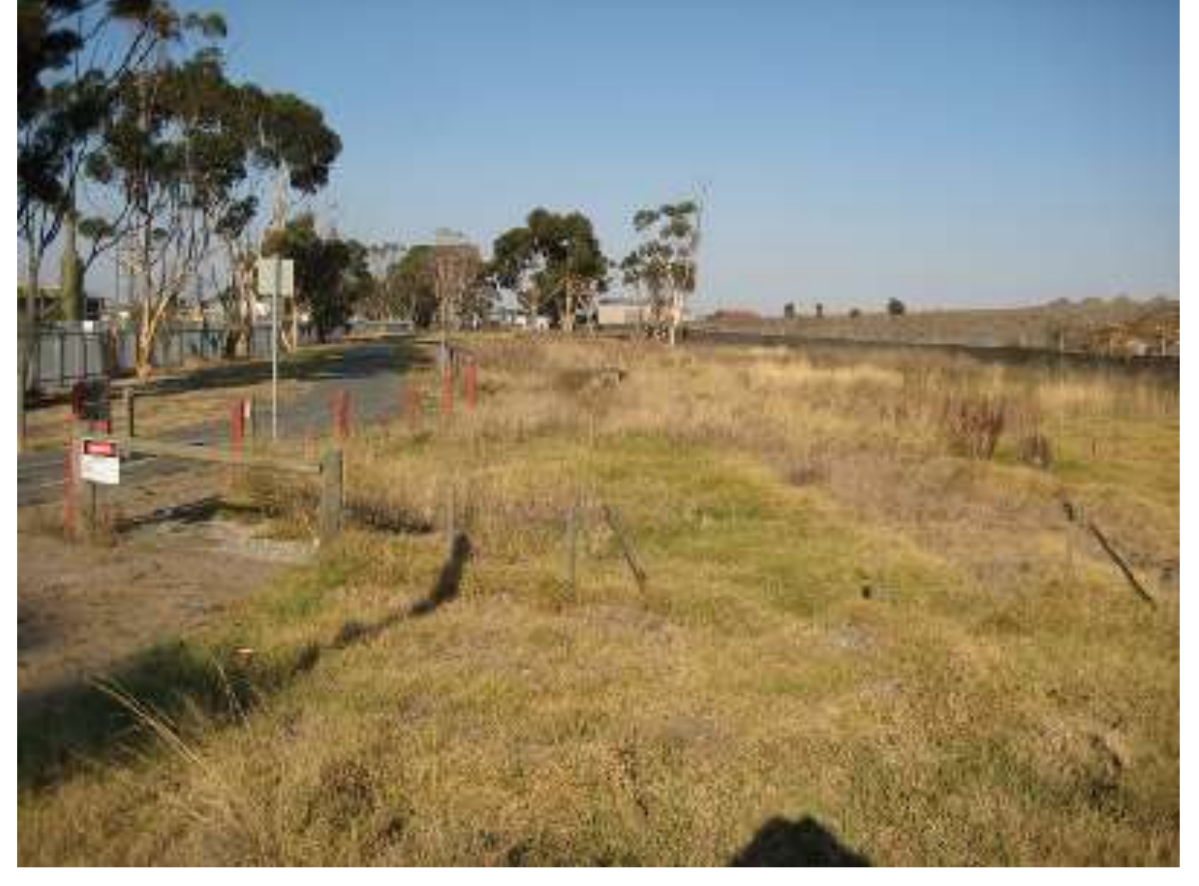
Trail easement before project commenced