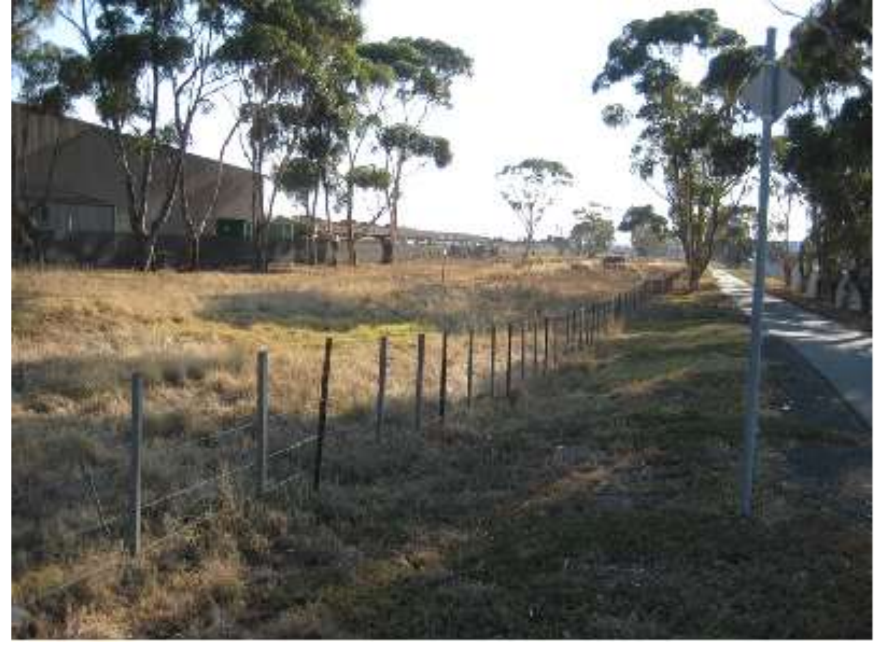
Trail easement before project commenced