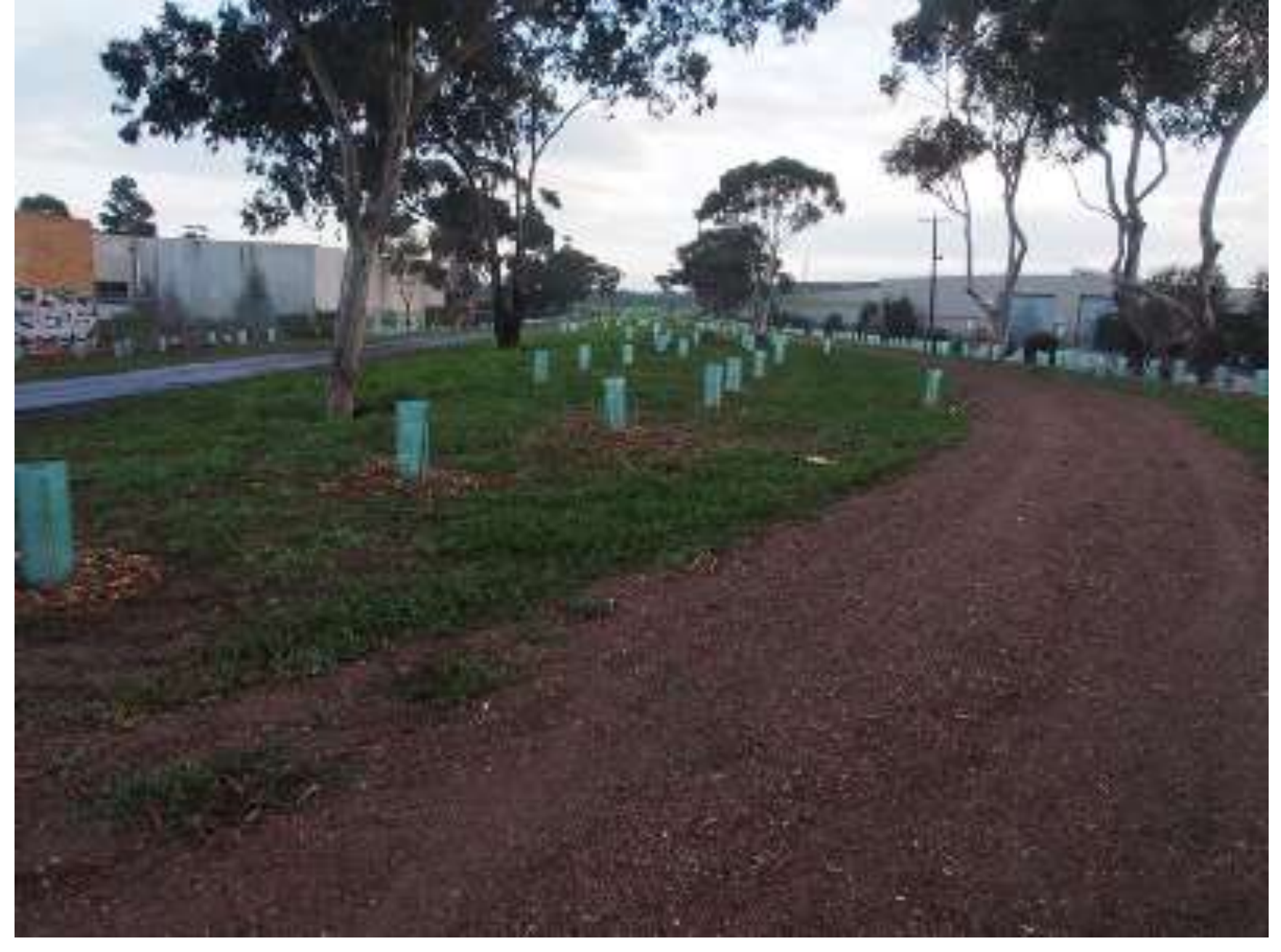
Planting commences along Federation Trail.