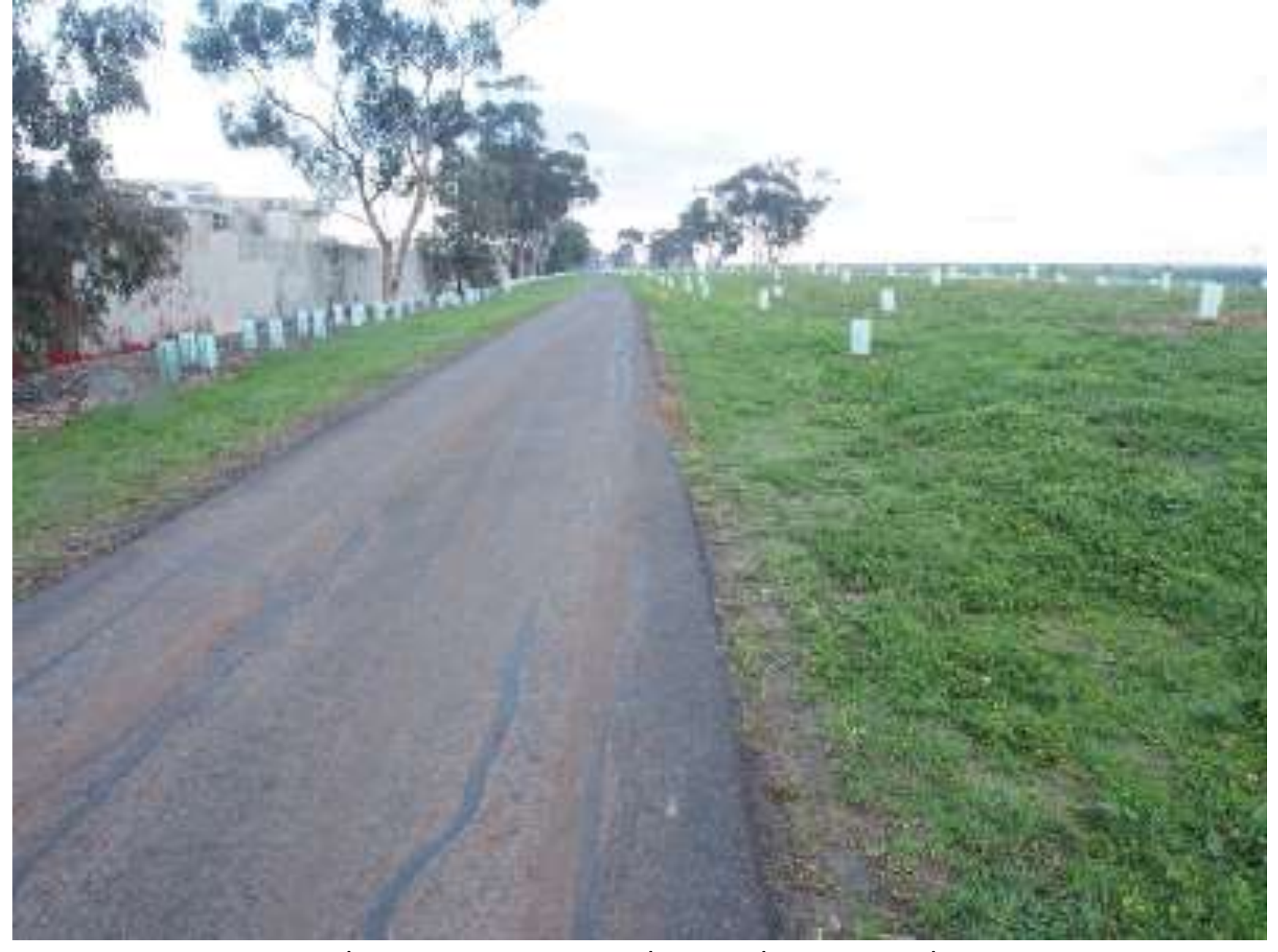
Planting commences along Federation Trail.