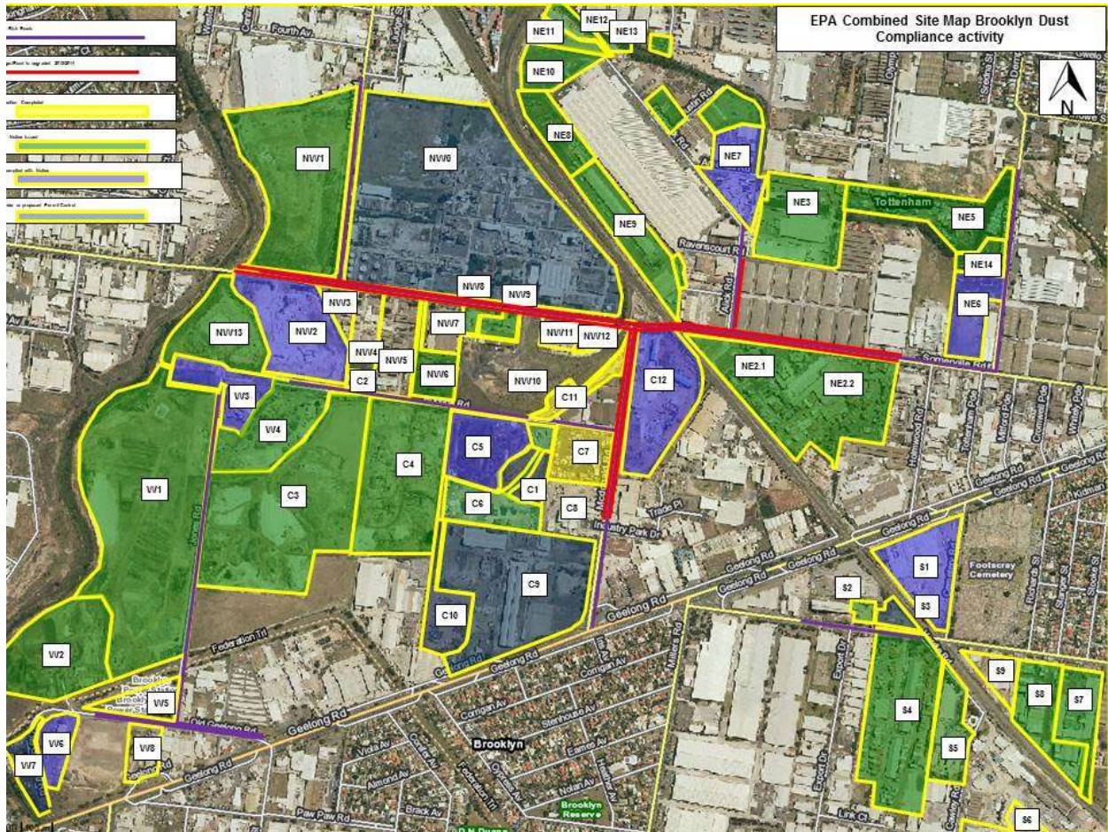
Fig 3 Dust Compliance Activity – Brooklyn

Key: Yellow - inspections completed, Green – final notice issued, Purple – complied with notice, Blue – under or proposed permit control, Red – verges/road upgraded