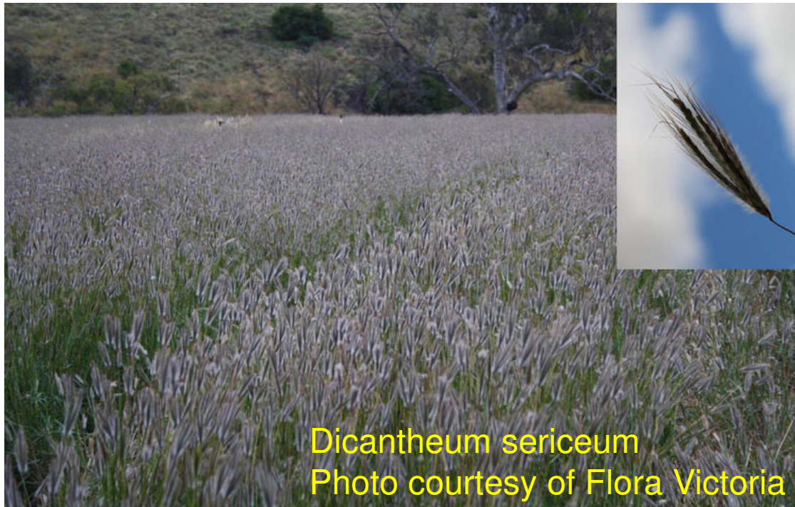
Dicrantherum sericeum