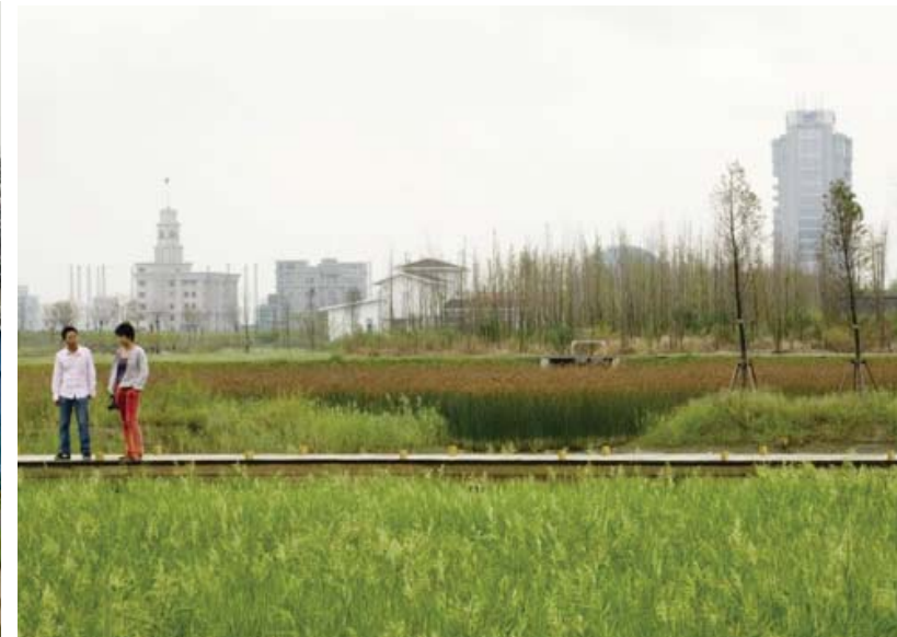
shanghai chemical plant