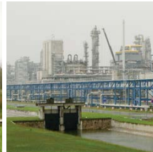
Brooklyn Industrial Estate today