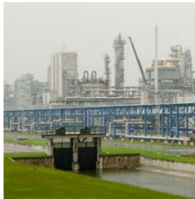
Brooklyn Industrial Estate today

SCIP was a polluted industrial park transformed with water to include conservation, education and sustainable development