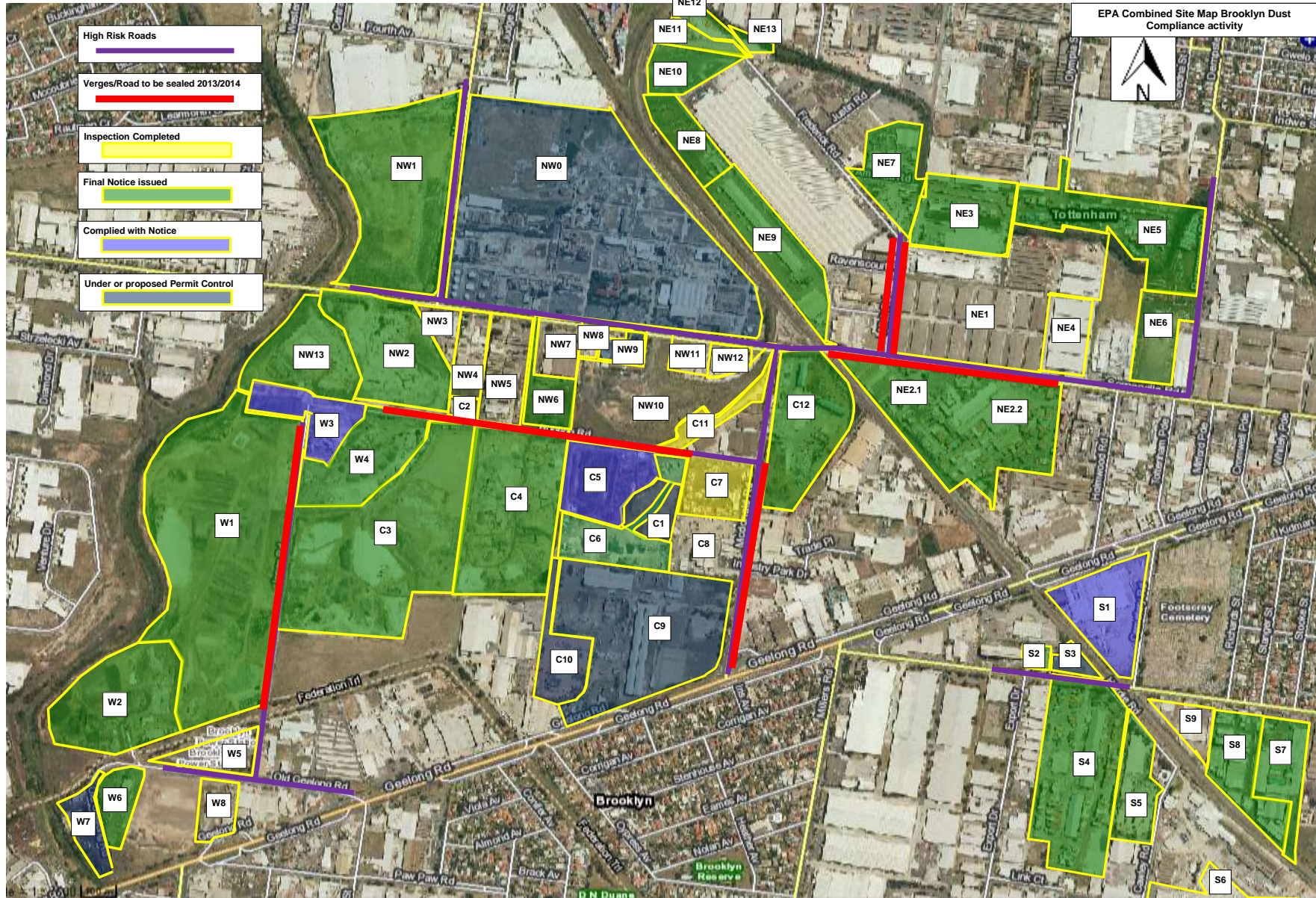
Fig 4 This map indicates sites in Brooklyn and the remedial tool in place to fix dust issues, it also includes roads with confirmed works.