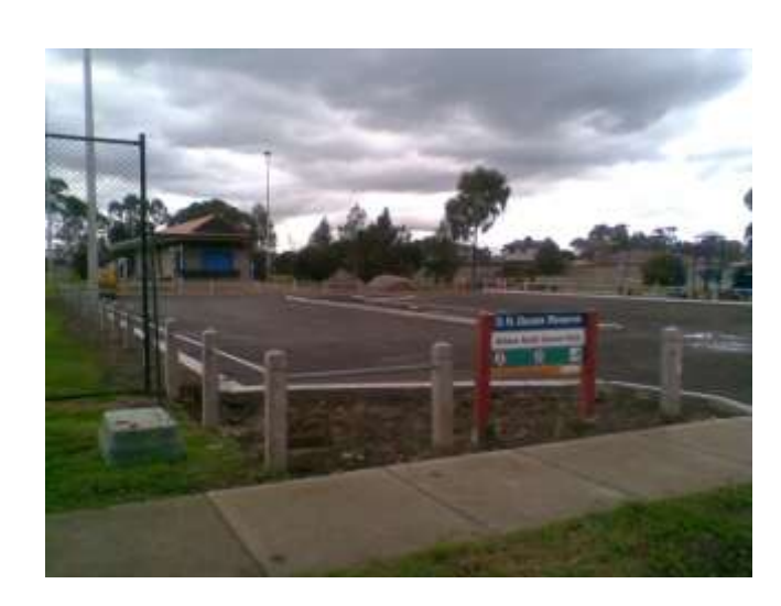
Entry to Federation Trail – Millers Road.