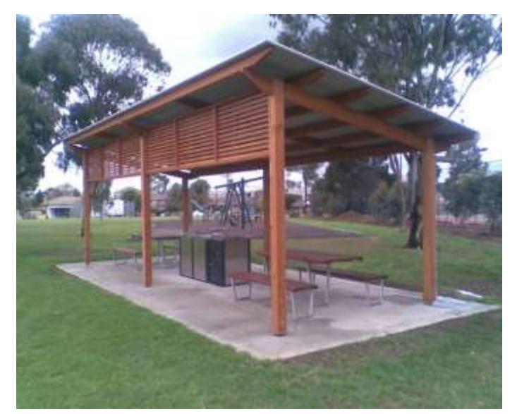
Brooklyn Reserve BBQ area.